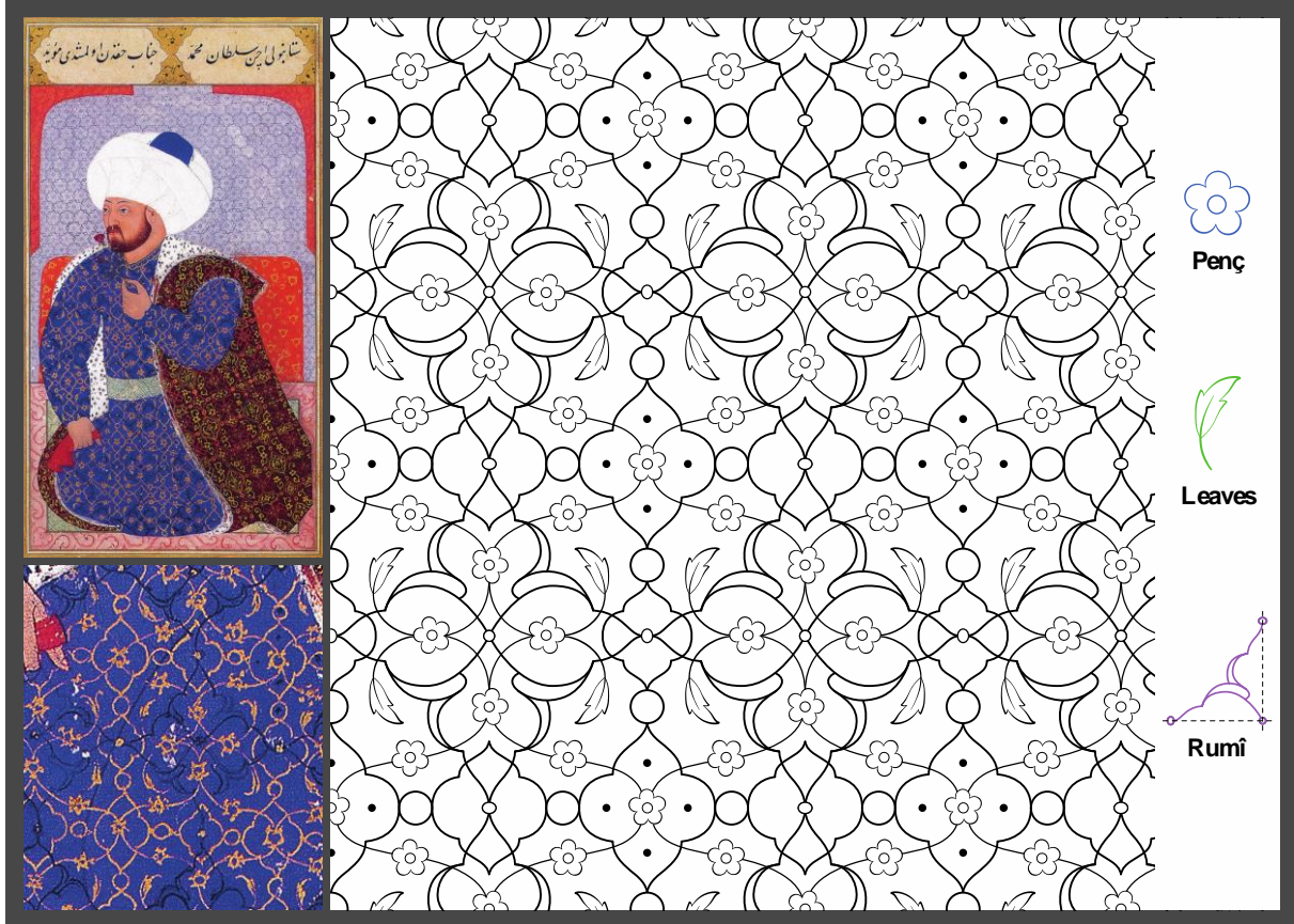
Image 3: Fatih Sultan Mehmed / Kıyâfet'ül-insâniye fî şemâ'ili'l-Osmâniye