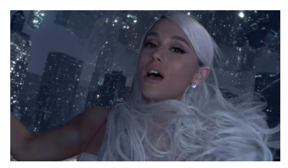
Images 14 and 15: Images from 'no tears left to cry' music clip (00^{\circ}02^{\circ}36 - 00^{\circ}02^{\circ}40)

But in the end of the first part of chorus with the words "Ain't got no tears left to cry" we find Grande on the fire escape stairs where she found the place she can "find her balance" again.