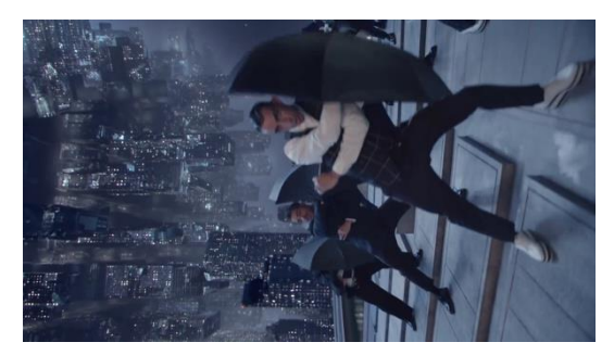
Images 9 and 10: Images from 'no tears left to cry' music clip (00'02'11 – 00'02'27)