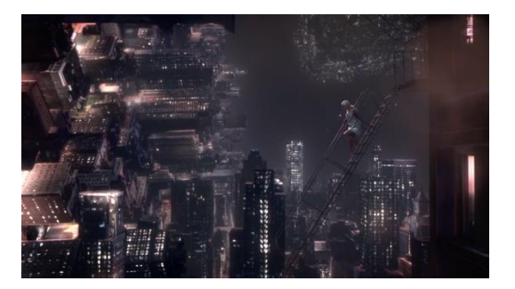
Images 16 and 17: Images from 'no tears left to cry' music clip (00^{\circ}02^{\circ}46 - 00^{\circ}02^{\circ}47)

As she finishes the chorus part, she emphasizes that she has many supporting faces, that is, voice in this context. This is essentially the case, but on connotative side, on her fourth studio album Sweetener (2018) the track 'get well soon' with the lyrics "I'm too much in my head did you notice?" and response she gave to situation with words "It's like I'm talking to every single thought in my head ... and they come back singing to me.." (Lansky, 2018) supports the idea of Grande having personality disorders.