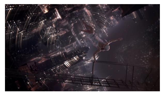
Images 5 and 6: Images from 'no tears left to cry' music clip (00'01'29 – 00'01'35)