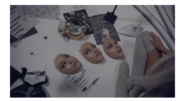
Images 22 and 23: Images from 'no tears left to cry' music clip (00'03'09 – 00'03'17)

The hairband accessory, which looks like the ears of the long black rabbit in the lower left corner of the stage, is similar to Grande's accessory she putted up on her hair on the cover of the 'Dangerous Woman' album.