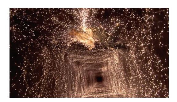
Images 3 and 4: Images from 'no tears left to cry' music clip (00'00'58 – 00'00'55)

In terms of its connotative meaning, this is the case after Grande's terrorist attack, "...When something very opposite and very poisonous happens in your own world, it is shocking and heartbreaking that seems impossible to heal..." (SkyNews, 2018). With these words she clearly shows how she is trapped in a state of emotion.