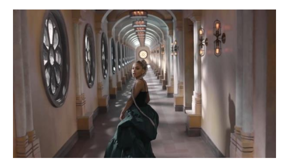
Images 7 and 8: Images from 'no tears left to cry' music clip (00'01'38 – 00'01'59)