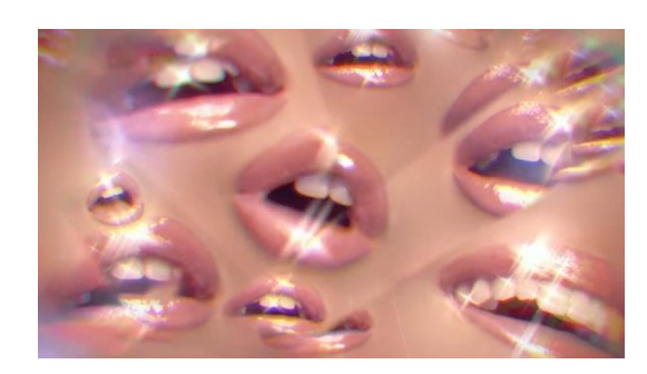
Images 18 and 19: Images from 'no tears left to cry' music clip (00^{\circ}02^{\circ}51 - 00^{\circ}02^{\circ}58)

In the intermediate section that connects the song with the last chorus, we find Grande in her upside-down world and sitting on the ceiling.