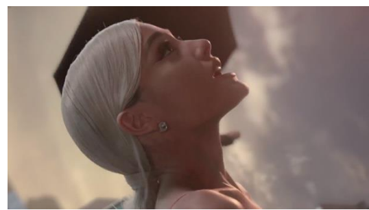
Images 31 and 32: Images from 'no tears left to cry' music clip (00'03'23 – 00'03'31)

In addition to the denotative meaning in question, this scene connotatively is a reference to Grande's ability to see "light" at the end of her troubles.