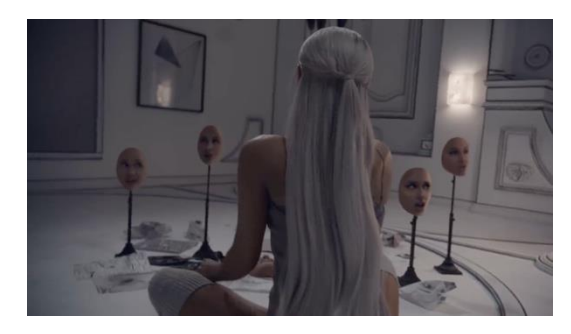
Images 20 and 21: Images from 'no tears left to cry' music clip (00'03'03 – 00'03'08)

The first thing that catches our attention in these stage passages is the mask that Grande has on her face and the face she puts alongside the others. In its denotative way, this may mean "masks" or behavior that we have to "wear" in everyday life. This, in terms of its meaning in this scene in the music video, supports Grande's personality disorders after the Manchester attack.