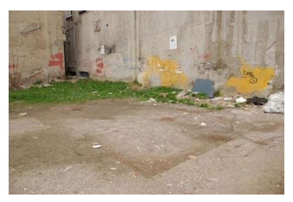
Figure 14. After dismantling: traces of a closed housing corporation (Özdamar, 2010a)

During the process dialogues with getting permissions outlined a general view of the dwellers that also had a position in real-estate market. Some of the dialogues outlined the approaches of housing institutions: