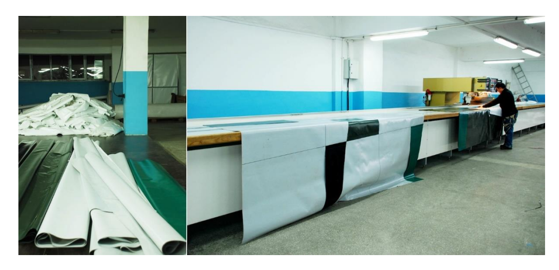
Figure 5. Fabrication process: From waste to surface (Özdamar, 2010a)

The spokesman for the housing corporation wore worker's clothing during construction and interviews to display the on-going process and stayed in front of the symbolic house every day—cleaning it, sitting in front of it, and waiting for interaction with the participants. On-site open discussions and interviews about likes and dislikes in housing policies and approaches were held with different participants, including children and the elderly, during the fifteen-day period. The corporation and the houses were dismantled at the end of the process. From the installation to the dismantling, the process became an insightful interaction for discussing housing at the social and political levels. Emerging and disappearing forms of institutions and their power on society, orientation of housing demands, and life-styles were metaphorically addressed. The discussions enabled experiences both for the performers and the participants (Figs. 6, 7, 8, 9, 10).