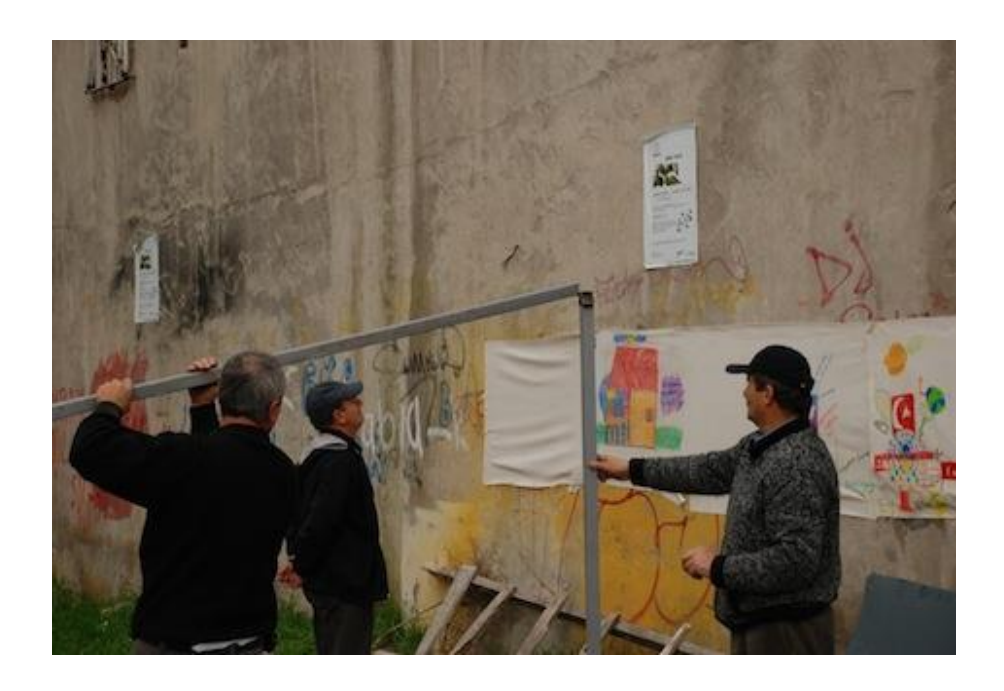
Figure 13. Dismantling the houses (Özdamar, 2010a)