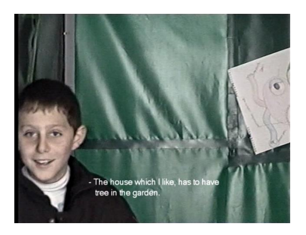
Figure 8. A young participant leaning and swinging against the 'smooth' surface of the houses while talking (Still image from video by Özdamar, 2010b)