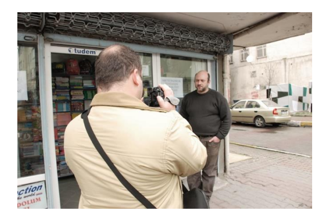
Figure 9. Interview with a dweller in the neighborhood (Özdamar, 2010a)