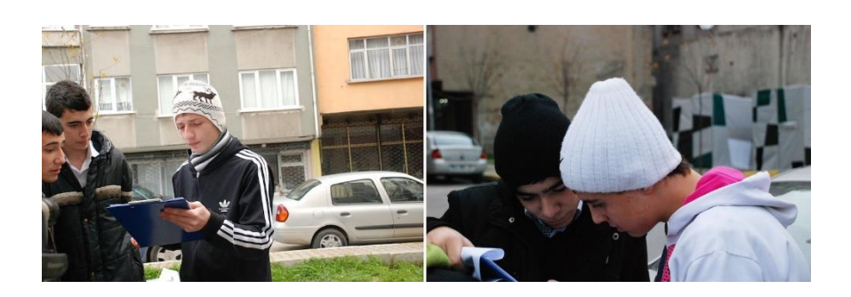
Figure 6. Young participants (Özdamar, 2010a)

The spokesman for the housing corporation wore worker's clothing during construction and interviews to display the on-going process and stayed in front of the symbolic house every day—cleaning it, sitting in front of it, and waiting for interaction with the participants. On-site open discussions and interviews about likes and dislikes in housing policies and approaches were held with different participants, including children and the elderly, during the fifteen-day period. The corporation and the houses were dismantled at the end of the process. From the installation to the dismantling, the process became an insightful interaction for discussing housing at the social and political levels. Emerging and disappearing forms of institutions and their power on society, orientation of housing demands, and life-styles were metaphorically addressed. The discussions enabled experiences both for the performers and the participants (Figs. 6, 7, 8, 9, 10).