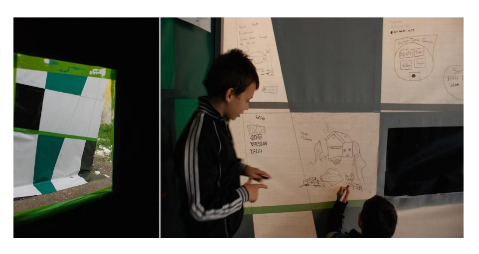
Figure 7. Inside as a reflection of ideas (Özdamar, 2010a)