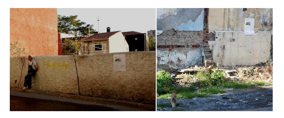
Figure 2. Announcement of Okkito through posters (Özdamar, 2010a)

approximately 150-square-meter-lot in Sefaköy<sup>1</sup>—an urban transformation area in İstanbul—was rented for fifteen days and two symbolic houses with the same dimensions were constructed and temporarily installed (Figs. 3, 4, 5).