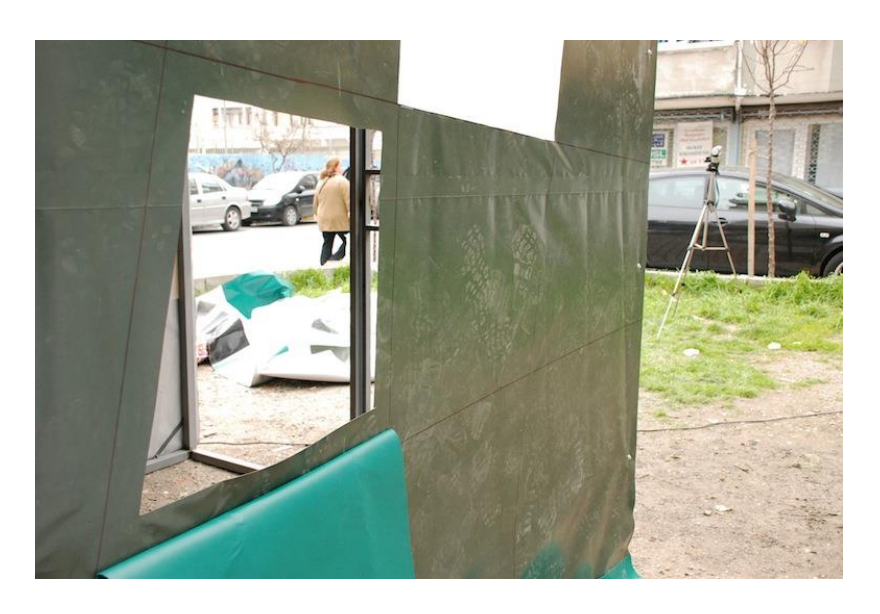
Figure 12. From the inside: the houses have outlooking eyes (two windows), which are the main entrance point to the interior (Özdamar, 2010a)