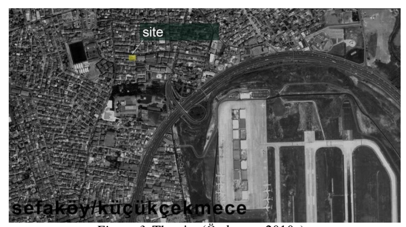
Figure 3. The site (Özdamar, 2010a)