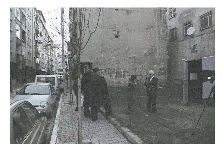
Figure 1. The founder and the spokesman of Okkito in discussion with participants (Özdamar, 2010a)

...We want to explore the changing meaning of housing in İstanbul. Meaning is plural and is formed by the dwellers. Together, we will design houses in specific fields. Because of our current construction capacity, we can build up to four houses that vary in size from 7 to 9 m2 on a piece of land of 15 m2, which is easily extendable. We build on-site solutions. Our Okkito assistants will help during the construction of houses. On 20th of August, there will be a raffle to distribute the houses and determine the dwellers. We want you to reconsider your own house because we believe that land is your public space!" (Özdamar, 2010a) (Fig.1).