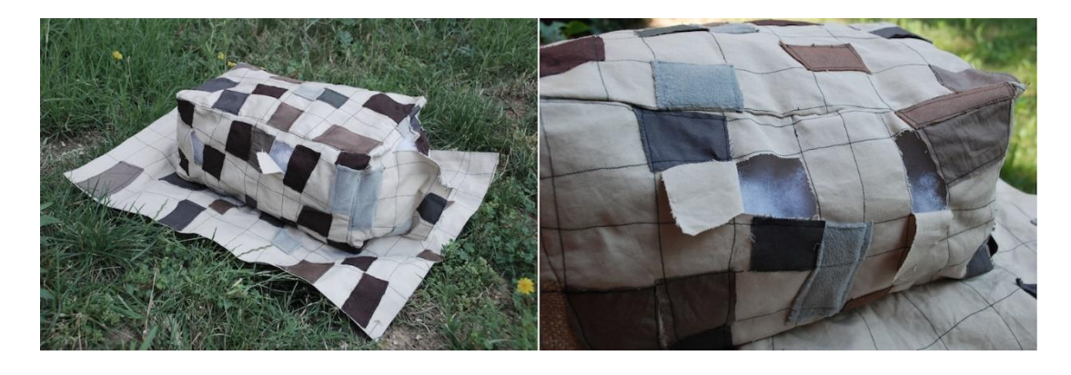
Figure 4. Sewing with fabric: From patches to land speculation (Özdamar, 2010a)